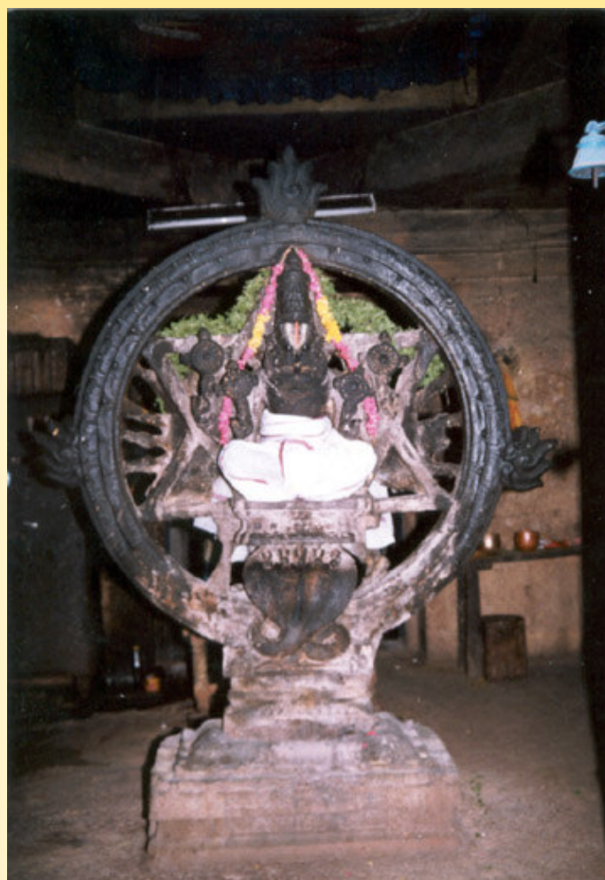
Sri Nrusimha Swamy on the backside of Sri Sudarshana at Kanchi