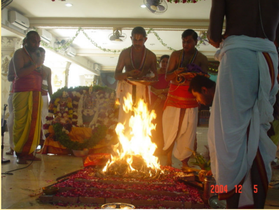
Sri Sudarshana Homam