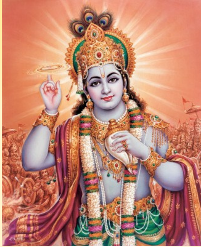
Sri Maha Vishnu with His Sudarshanam