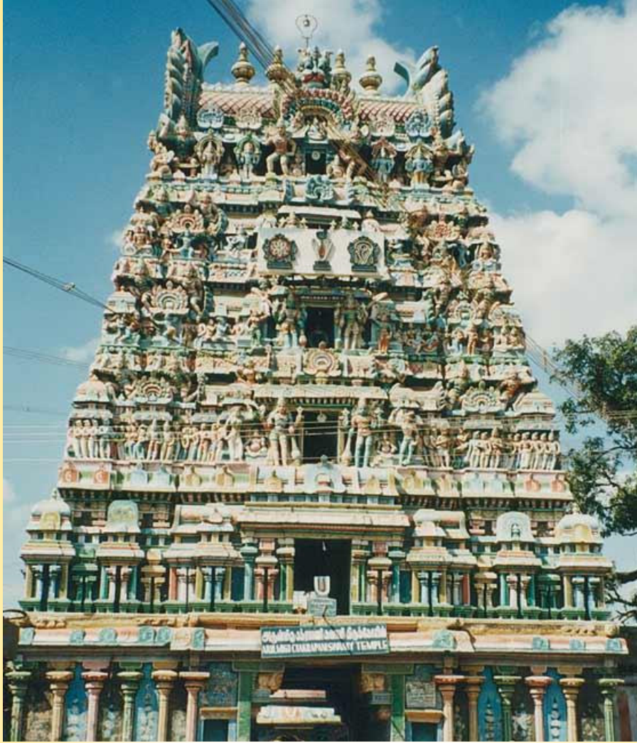
Gopuram of Sri Chakrapani Koil , Kumbhakonam The only Temple dedicated to Sri Sudarshana