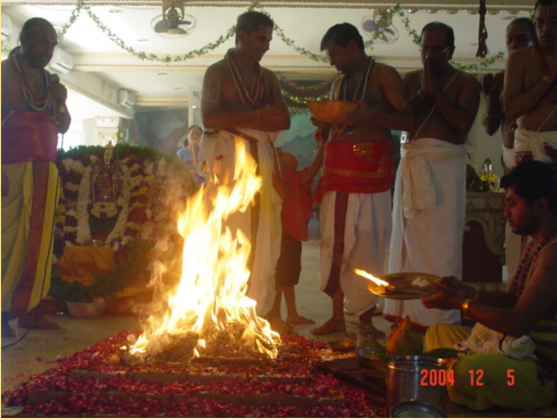
Maha Sudarshana Homam

darsana Sathakam to give us an understanding of the MahA MangaLams arising from Sri Sudarsana manthra japam, Homa Karyam and SthOthra Padanam.