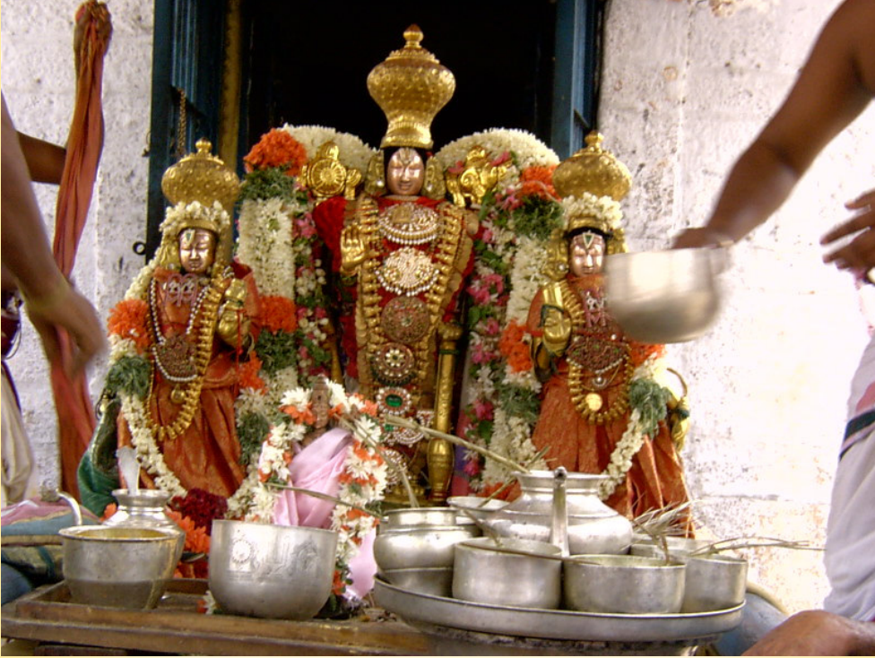
Sri Viajayaraghavan and Sri Chakrathazhwar theerthavari thirumanjanam

Swamy NammazhwAr instructs us here through this Phala sruthi Paasuram that any one, who masters this decad will be blessed with victory in all their endeavours by Appan (sarvaasrayaNeeya Swami). AzhwAr states that he had attained a state of Tanmayathvam (OnRi ninRa SaThakOpan) with the Lord over the sevais illustrating Appan's Vijaya Sri and instructs us that the Sarva Sulabha aasritha rakshakan will bless us with victory (venRi tarum) in all their endeavours, when they master this decad of Paasurams celebrating the Appan's aasritha rakshaNam .